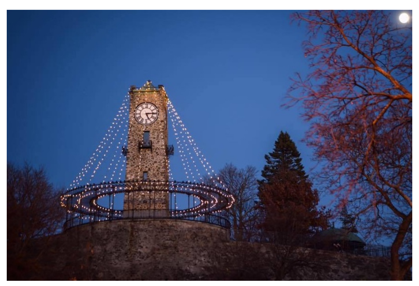
Jenks Park Tower in Central Falls, Rhode Island.

thrilled about your background in New England, believing that New England Scouting is different from Scouting around the country. Yet, you also have exposure to other councils. Why do you think these two perspectives will allow you to see the field differently than someone from just New England or another region?