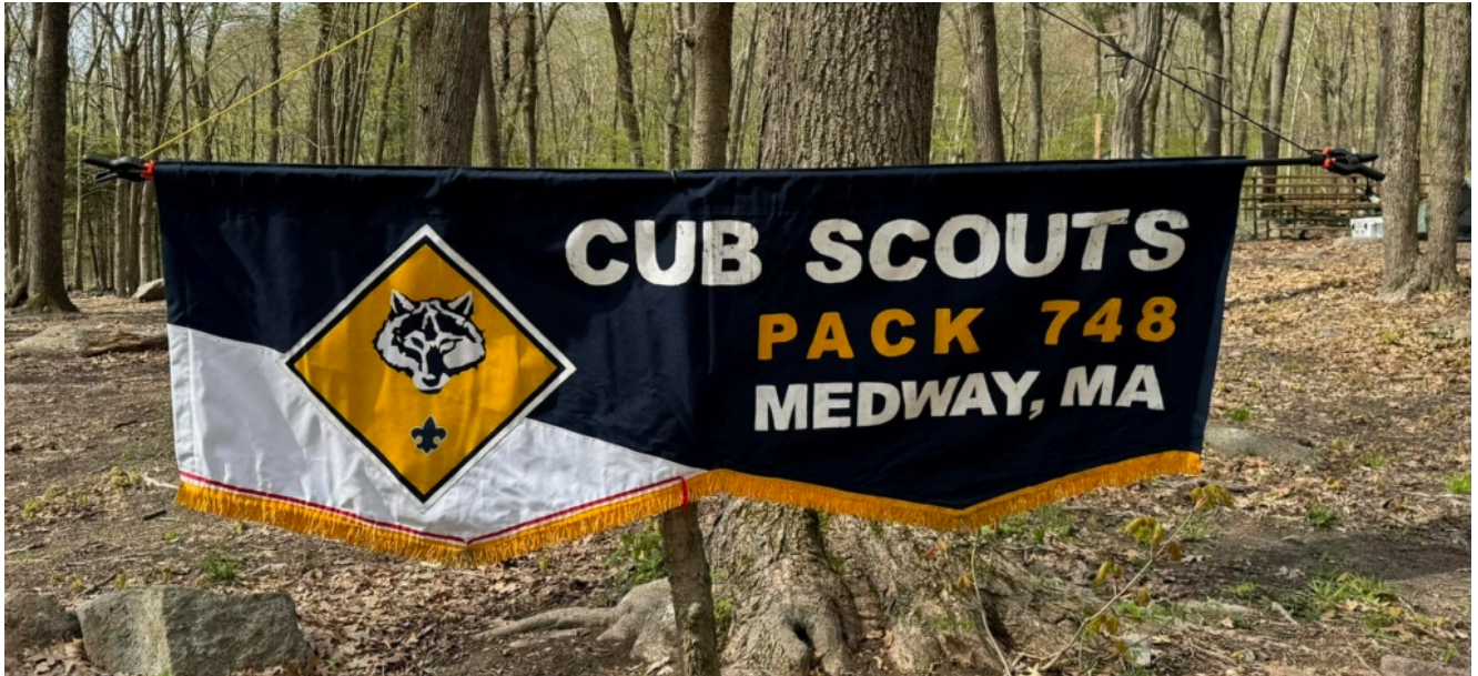
Pack 748 Medway