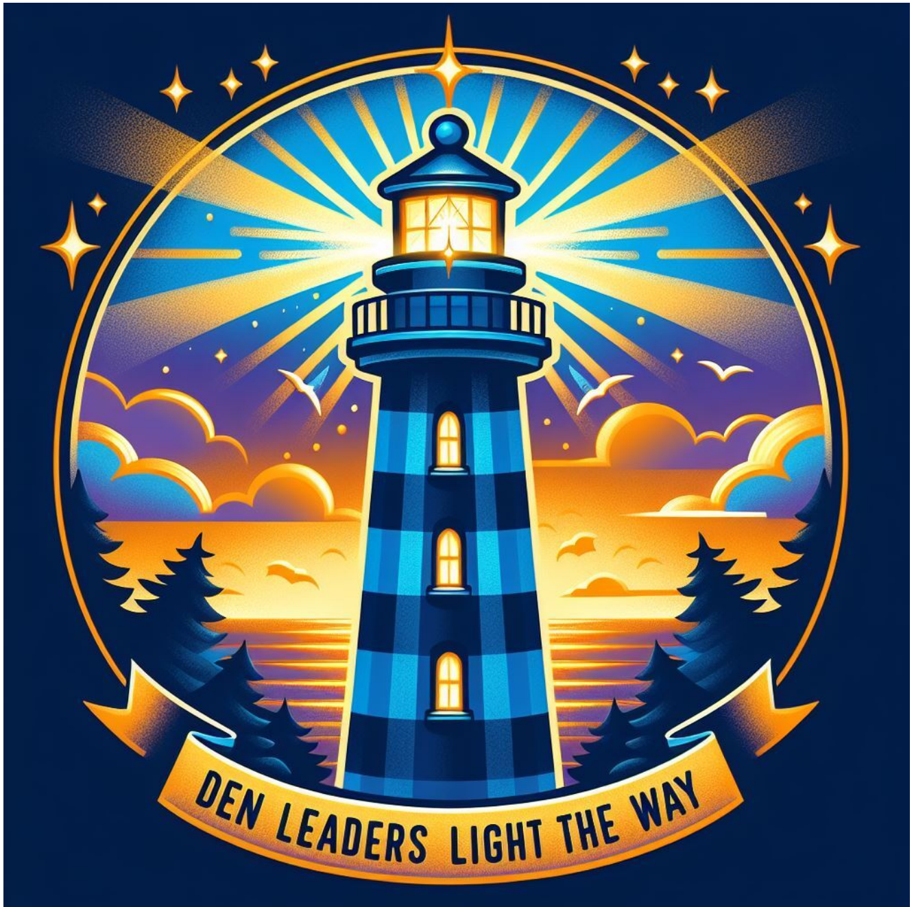
Den Leaders Light the Way

media weekly in May. Check out our five superlative Den Leaders, each collected here.