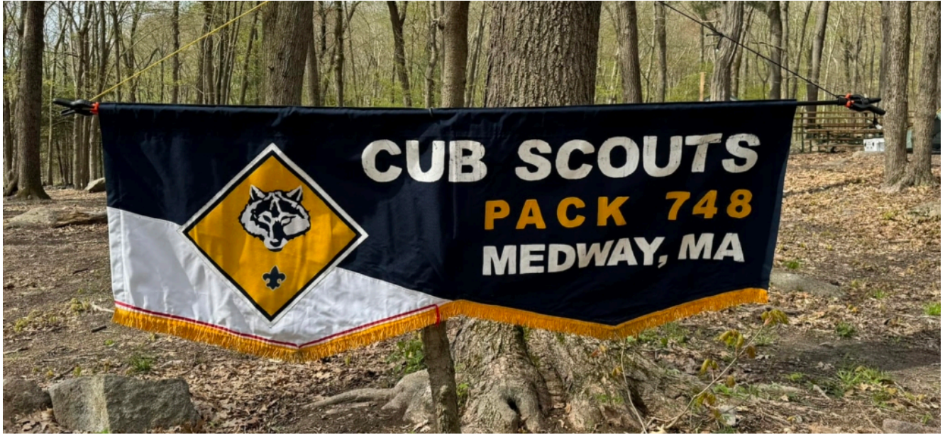
Pack 748 Medway