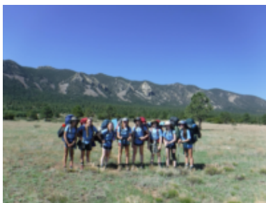
Troop 65 at Philmont Trip

Scouting is famous for “productive failure,” and Ari's journey provided the ultimate testing ground at Philmont Scout Ranch. On just the second day of her trek, Ari contracted COVID-19. Despite being exhausted and sick, she pushed through four grueling miles on Day 3 before entering a quarantine camp. Proving her mental