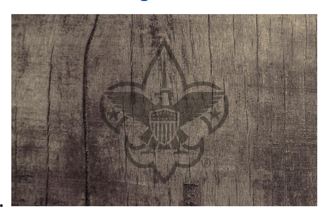
March Training Newsletter