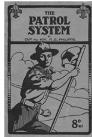
The Patrol System by Roland Philipps, 1914

-Roland Philipps, Commissioner for East London, The Patrol System, 1914