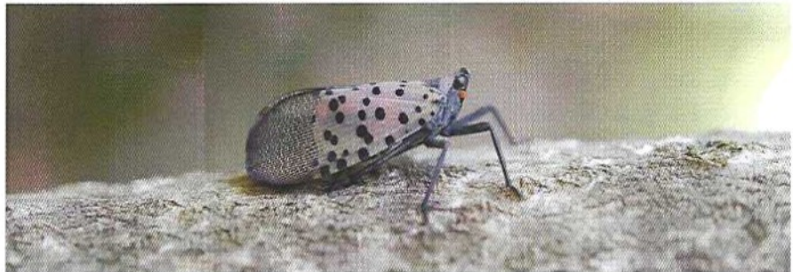
Adult spotted lanternfly