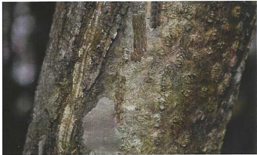
Covered and uncovered egg masses