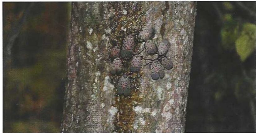
Cluster of adults on the trunk of a tree at night