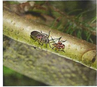
Spotted lanternfly nymphs are black with white spots in early stages of development and turn red before becoming adults.